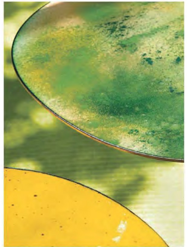
From top: Paola Lenti's Sabi sofa is made with rope cord. Together with the Giro occasional tables, they're an example of the brand's commitment to quality craftsmanship rendered in a modern yet timeless aesthetic; a detail of Paola Lenti's Strap tables topped with Esmal, handcrafted enamel copper.

Through a detailed lens of furnishings, accessories and clever architectural elements, the showroom hosts a collection of intimate design moments—each