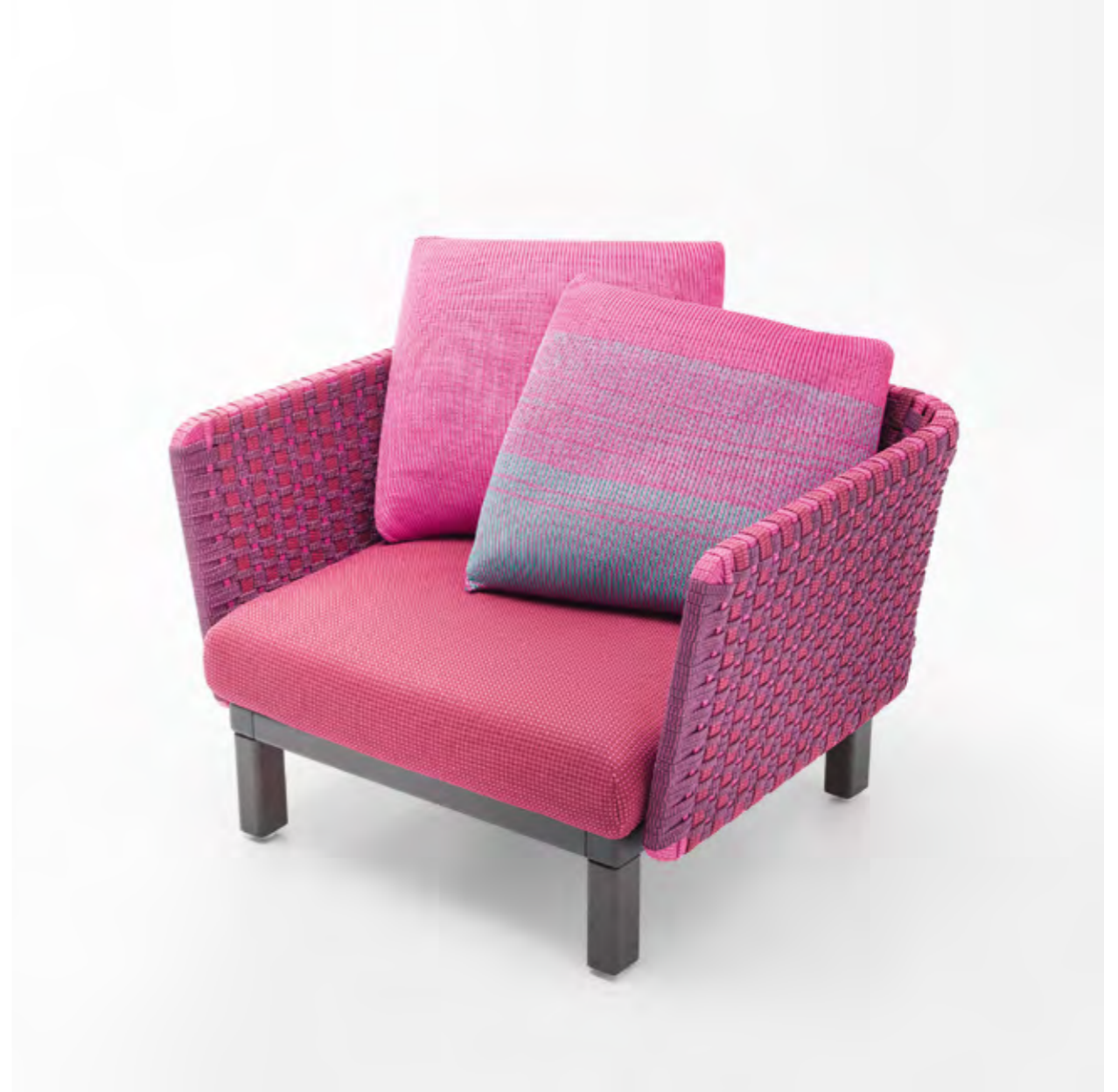
SABI Rope T1514, T1415, structure LE220