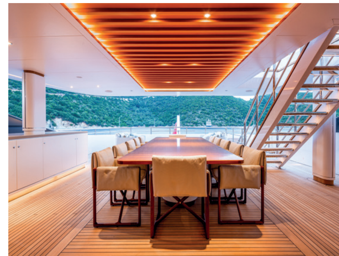
Filo conduttore del design è la convivialità proposta dalla configurazione indoor-outdoor del salone principale, che affaccia direttamente sull'Oasis Deck.

del ponte principale. Su tutti, l'Acero Frisé color avorio con increspature naturali molto tipiche e, a contrasto, il legno Ziricote, una delle essenze più pregiate in assoluto che, proveniente principalmente da Brasile e Nicaragua, si distingue per il peculiare color marrone scuro inframezzato da striature nere e oro. Gli arredi comprendono pezzi unici di alta artigianalità disegnati dall'ufficio stile del cantiere, come i due divani all'ingresso, e complementi di firme prestigiose, come i tavolini bassi di Paolo Castelli o le poltrone di Minotti e Cassina, liberamente collocabili nei ponti principale e superiore. Completamente rivisitata, rispetto ai precedenti B.Now 50M, la zona centrale, che l'armatore ha preferito dedicare a spazio lounge, con sedute basse e mobile bar in marmo Onice Miele, anziché ad area pranzo. Procedendo verso prua si incontrano la galley, da cui il personale di servizio accede separatamente al proprio quartiere (a prua del lower deck) e ai ponti superiori, e sul lato opposto un bagno giorno cui segue la suite armatoriale: uno spazio privato di grande eleganza che si sviluppa a tutto baglio per