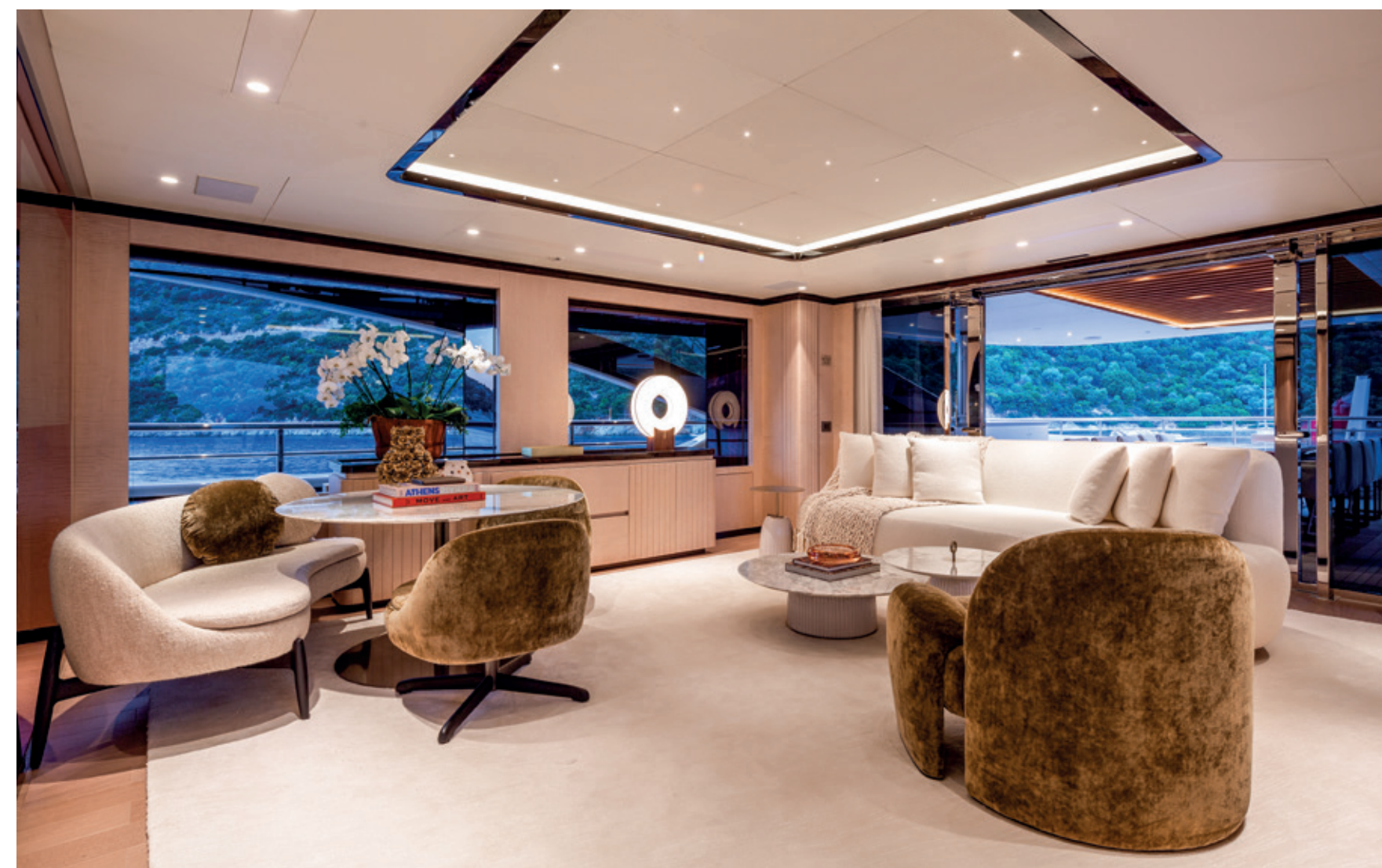
The central themes in the design are the opportunities for socialising created by the indoor-outdoor configuration of the main salon, which looks right onto the Oasis Deck.