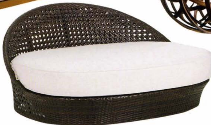
Amadeus rotating day bed in synthetic wicker, H74xW145.5x D132cm, £799, John Lewis.