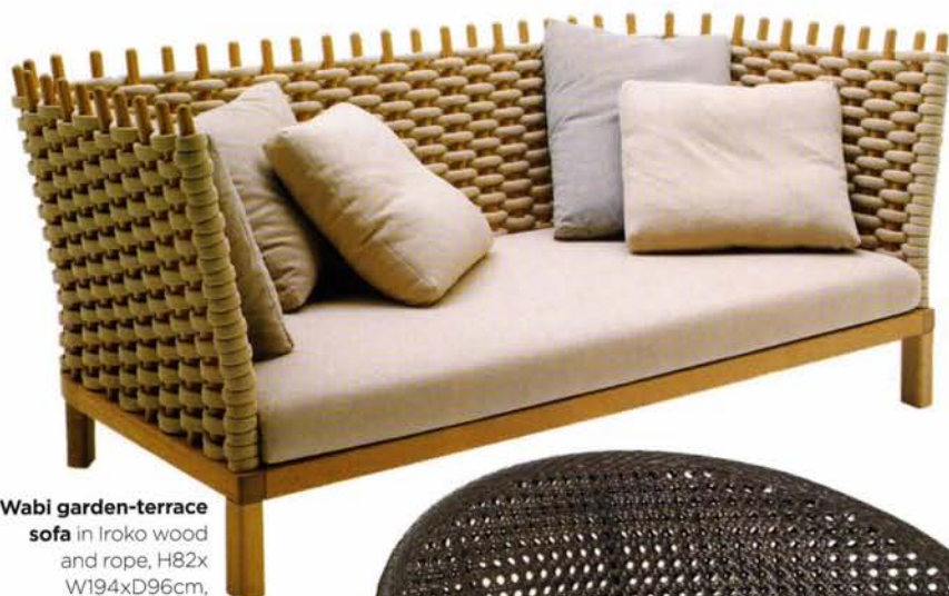
Wabi garden-terrace sofa in Iroko wood and rope, H82x W194xD96cm, £8,185 Paola Lenti at Chaplins.