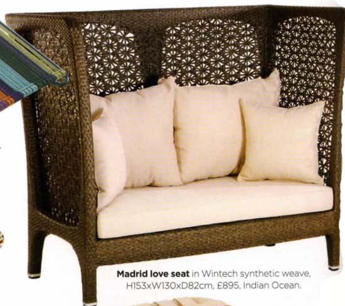
Madrid love seat in Wintech synthetic weave, H153xW130xD82cm, £895, Indian Ocean.