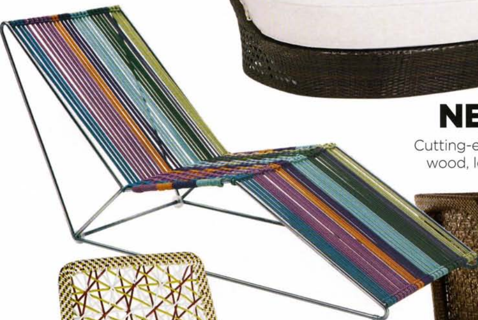
Cordula lounge in polyester cord, H82xW65xL174cm, £1,944, Missoni Home at Outdoor Chic.