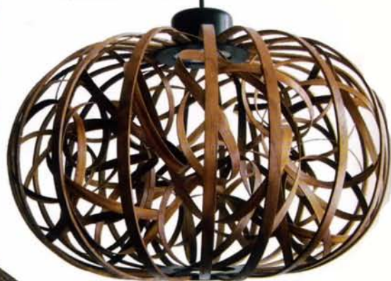
Ribbon pendant light in walnut, H32x diam55cm, £435, Tom Raffield at Mark.