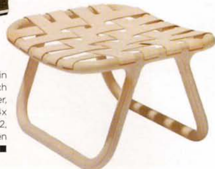
Camping stool in moulded beech and leather, H67xW64x D60cm, £1,742, Jesper K Thomsen at Bodie & Fou. ■