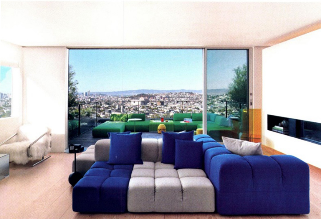
Previous spread: In a San Francisco home by local firms CCS Architecture and Subject to Change, a top-floor terrace features Ola seating and varnished-aluminum Strap side tables by Paola Lenti.