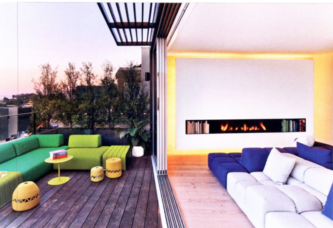
Clockwise from top: Sliding glass pocket doors in the fourth-floor living area open onto a terrace overlooking the city; a backlit edge makes the fireplace appear to float. The spa-like bath has honed Carrara marble slabs on the floor and walls. A stainless-steel hot tub invites plunging.