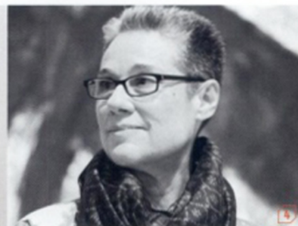
Paola Lenti of Paola Lenti

product Rilievo standout The patchwork of wool felt rectangles, appliquéd with colorful wool cords, is available in a veritable rainbow of 104 hues. Through DDC NYC. ddcnyc.com