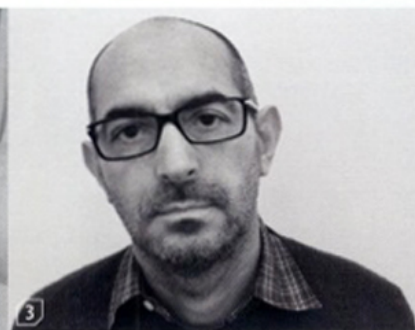
Ferruccio Laviani for Londonart

product Mallet standout Hand-tufted of viscose and wool, the playfully stripy rug perfectly epitomizes the Italian designer's thoughtful and unique creative spirit. londonart.it