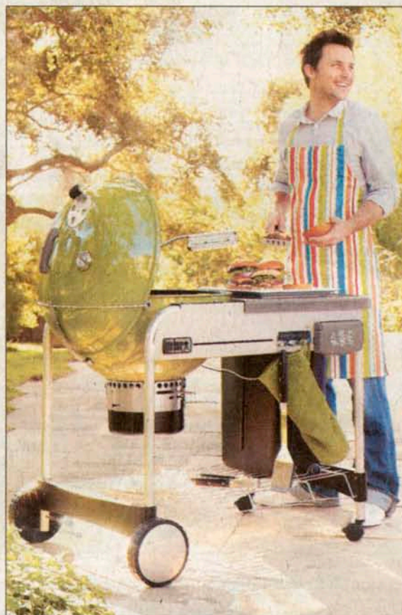
Crate &amp; Barrel