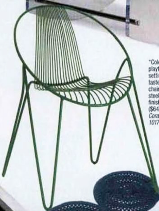
"Color and whimsy take playfulness to the outdoor setting with polished good taste." The Madame O chair is tubular structural steel with epoxy lacquer finish. Roche Bobois ($640). 450 Biltmore Way, Coral Gables, 305-444-1017; roche-bobois.com