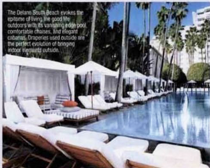
The Delano South Beach evokes the epitome of living the good life outdoors with its vanishing edge pool, comfortable chaises, and elegant cabanas. Draperies used outside are the perfect evolution of bringing indoor elements outside.