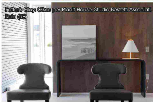
Potter's Clay: Oikos per Planit House, Studio Besetti Associati, Rolo (RE)